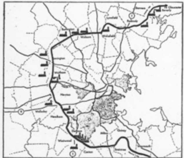
THE MAGIC SEMICIRCLE , Route 128 has brought industrial boom to Boston's rim. Built as interchange road, more than 40 plants now beset its path.

1954 New zoning by-law are designed to curb growth by increasing the lot size required to build. Much of the remaining developable land was put in Residential Class A, requiring a minimum of 60,000 square feet. As a second growth control measure, the town increases buying of conservation land.