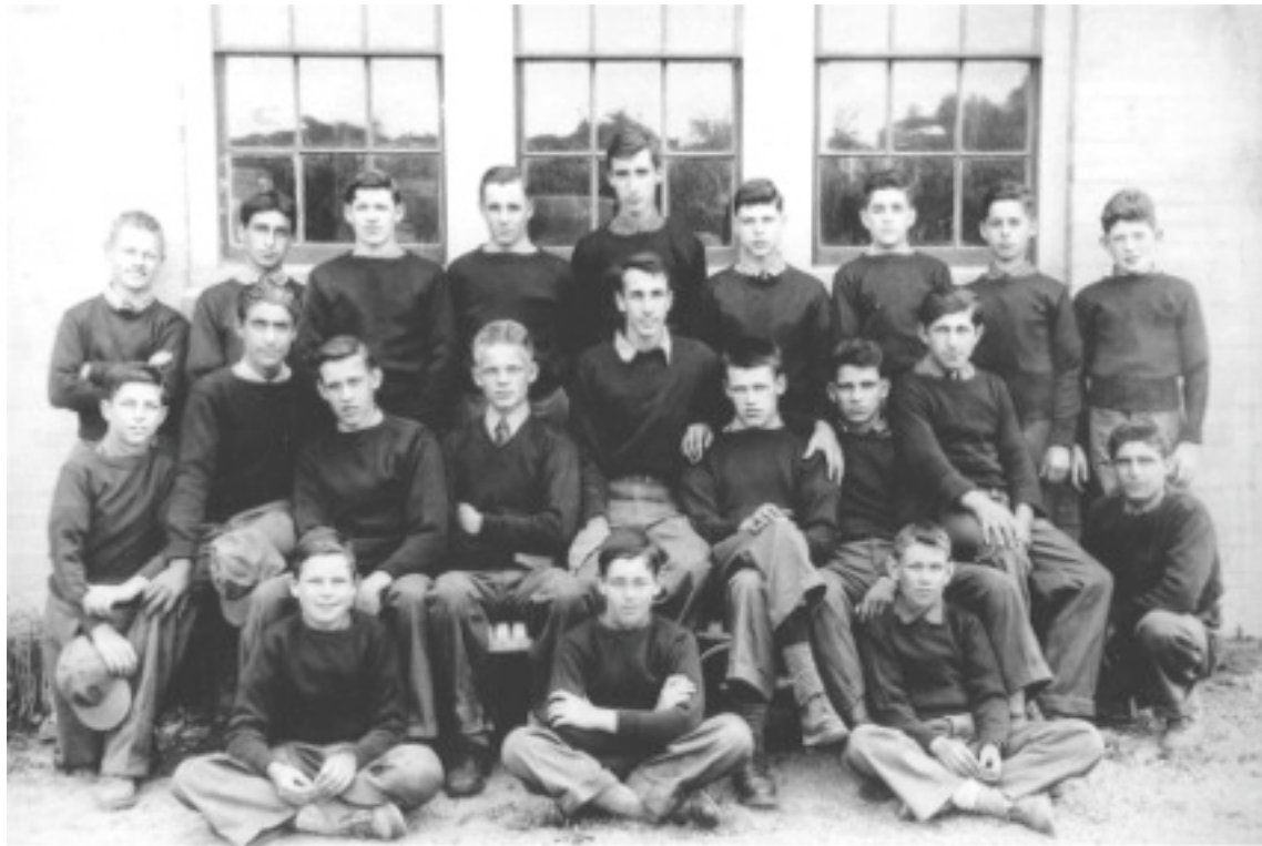
Hillcrest Boys, photo c. 1938