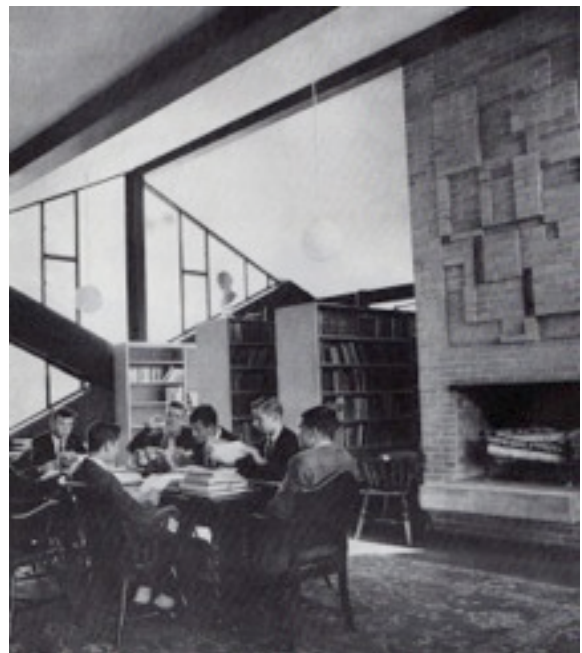
Above: Purchases of conservation land; Center: Country School; Below: Woodland School. Right: Rivers School.